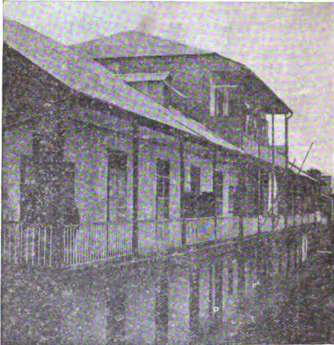
"STAR & HERALD" BUILDING, WHERE THE PAPER WAS FIRST PUBLISHED.